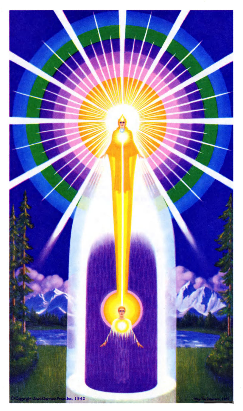
The Magic Presence