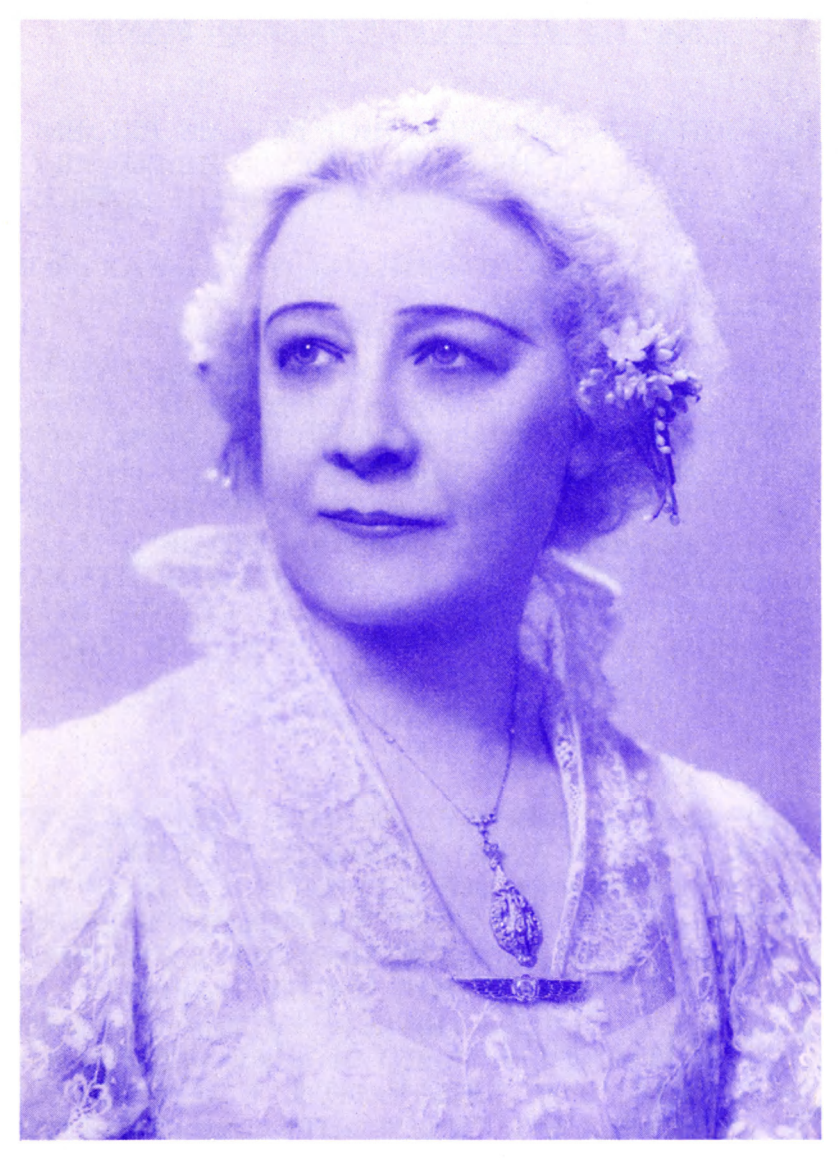
LOTUS, OUR LOVED ONE ASCENDED