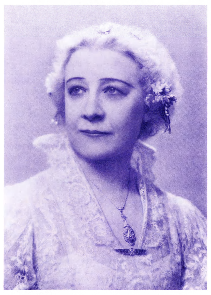
LOTUS, OUR LOVED ONE ASCENDED