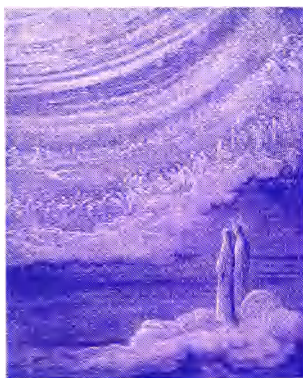
LIMITLESS LEGIONS OF ANGELS