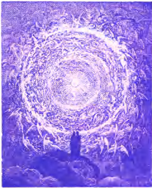
GREAT CENTRAL SUN ANGELS