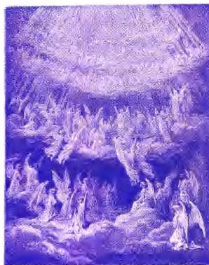
RAINBOW RAY ANGELS

Rainbow Rays Angels Pictures, 22x28'' – in VIOLET or BLUE . . . . . 5.00 Large Angel Pictures 11x14'' in VIOLET or BLUE . 1.50 Gift Card Angels with Blessing, 4½x5½'' in VIOLET or BLUE, with envelope . . . . . .25 (Prices above each net, no discount.)