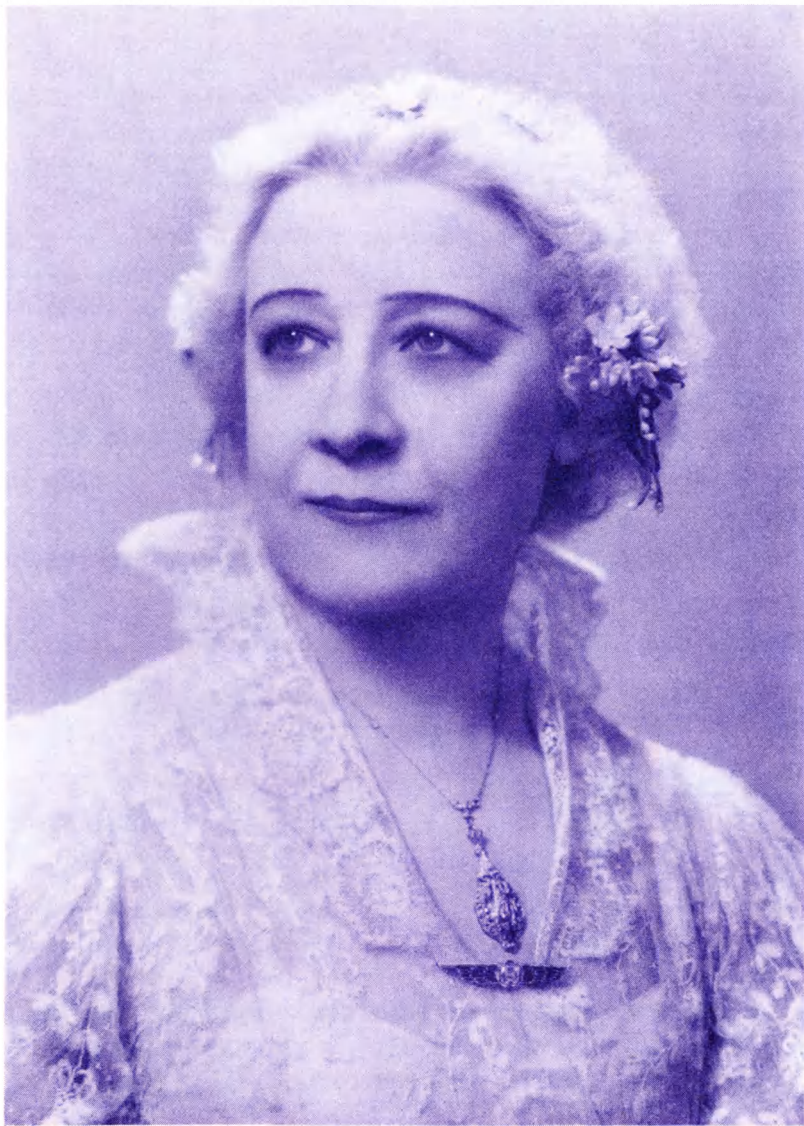
LOTUS, OUR LOVED ONE ASCENDED