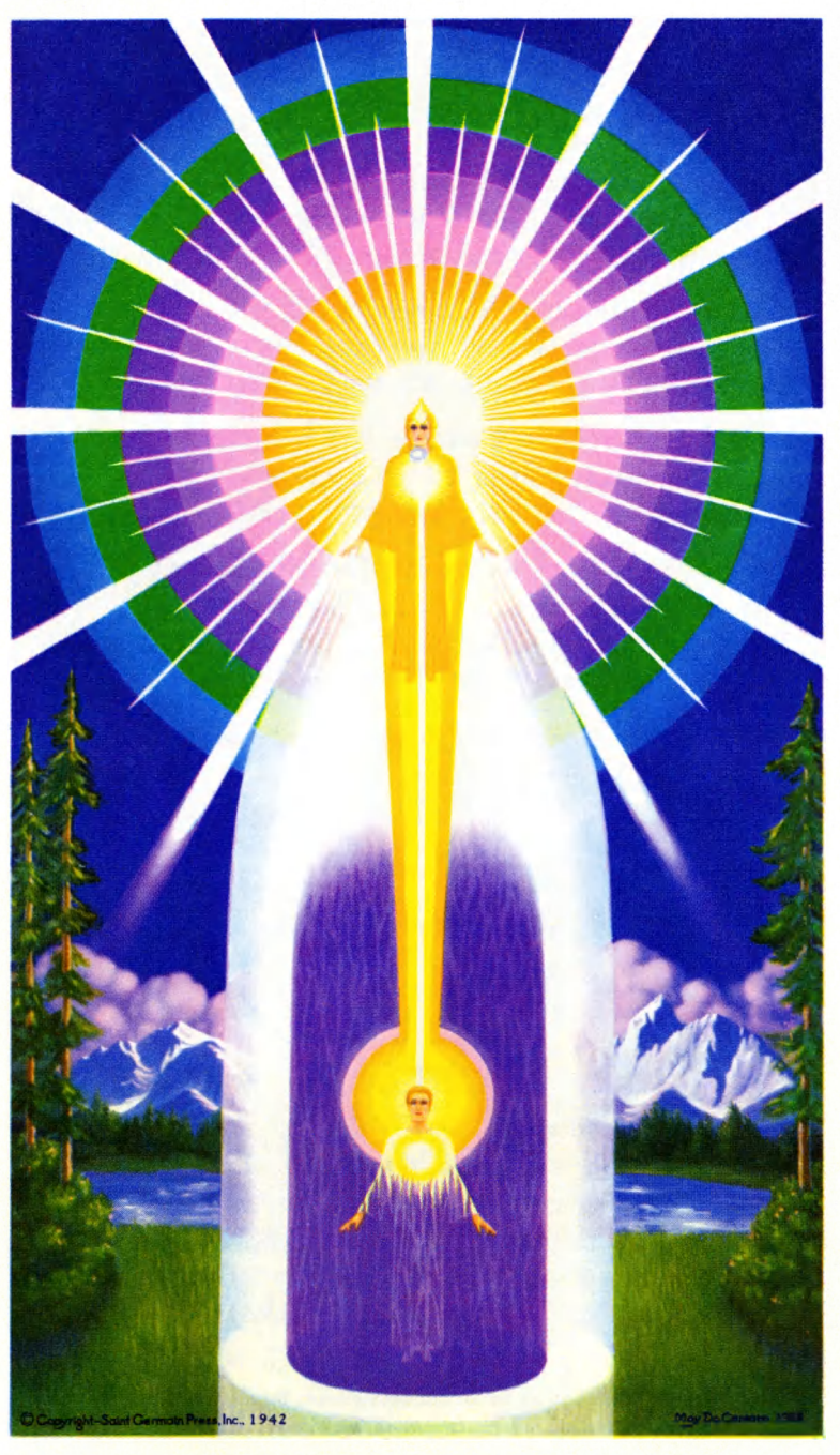
The Magic Presence