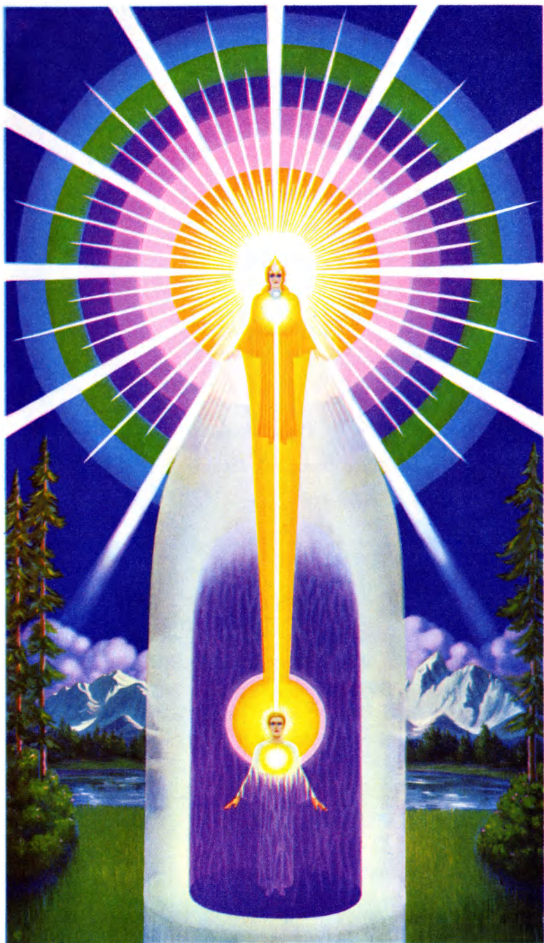
The Magic Presence